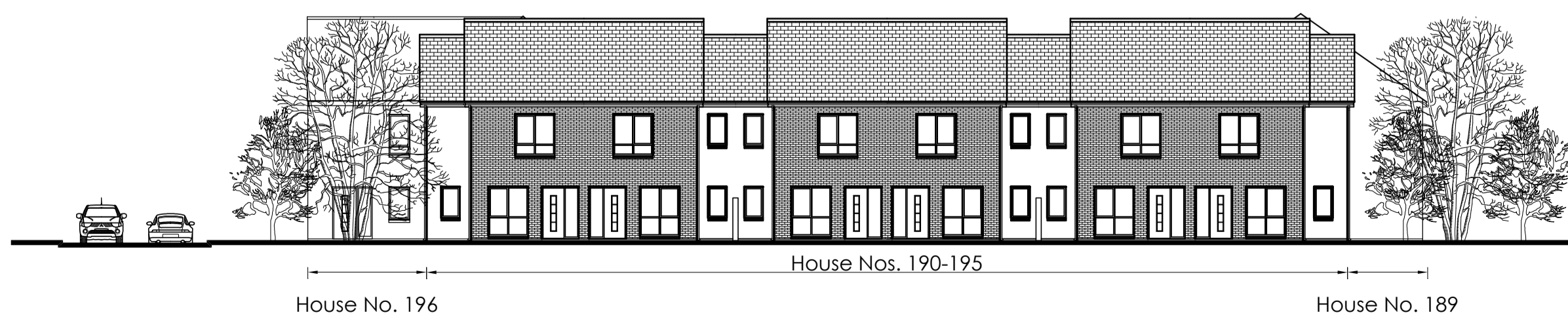
■ Contiguous Elevation No. 37