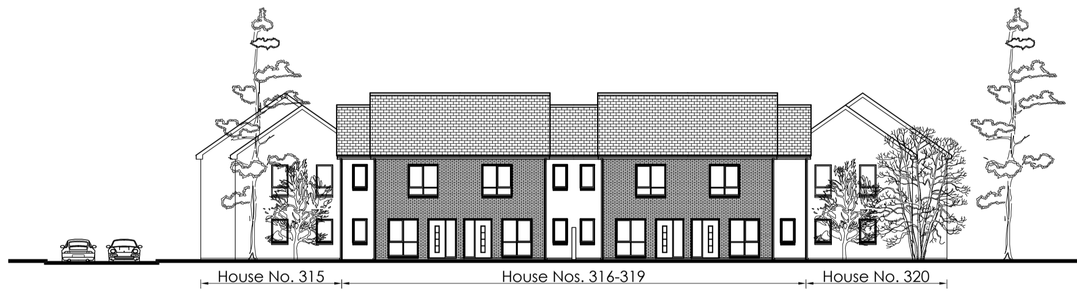
■ Contiguous Elevation No. 34