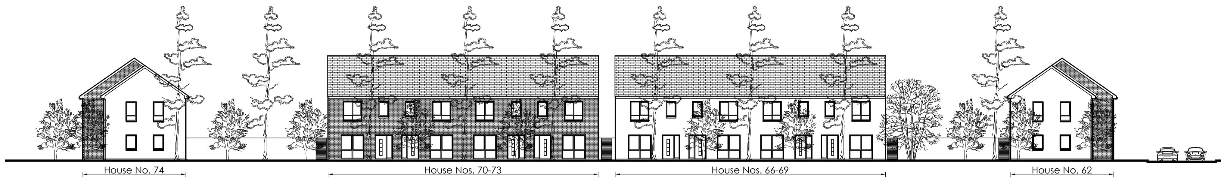
■ Contiguous Elevation No. 36