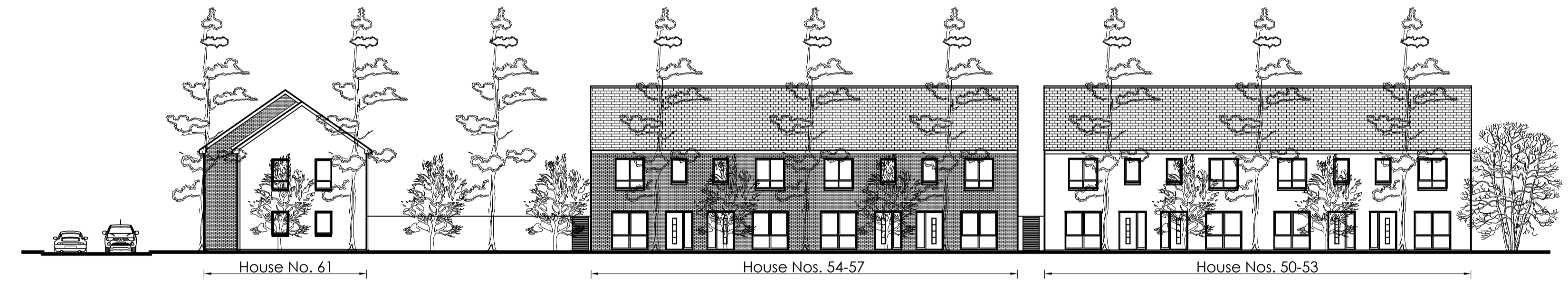
■ Contiguous Elevation No. 35