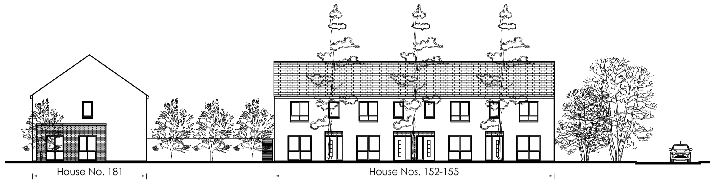
■ Contiguous Elevation No. 31